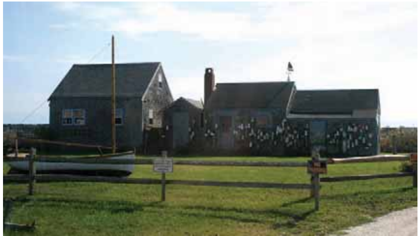
A home at the eastern end of downtown's waterfront.

The panel also recommends creating strong connections between Mid-island and downtown. Steps should be taken to encourage easier connections for bicycles, transit, pedestrians,