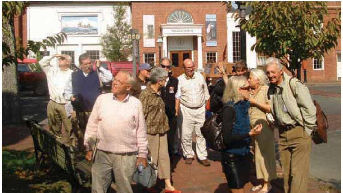
The ULI panel and sponsors in front of the Whaling Museum.

By encouraging development of year-round and income-diverse resident housing in or near downtown, Nantucket will add to the long-term viability of the area and improve the opportunity for business success. Nearby residents will aid in supporting economic vitality. These residents will assist in animating the streets of downtown and be more likely to use local businesses.