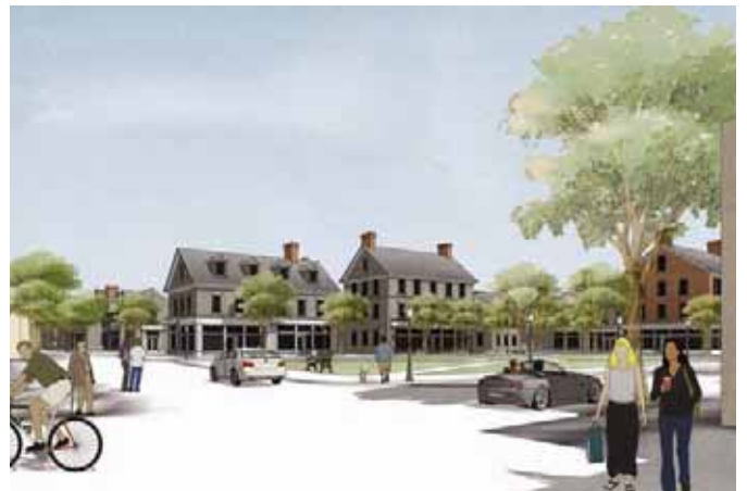
Perspectives of the new waterfront neighborhood detailing mixed-use buildings, traditional architecture, and the vital but restrained town square.