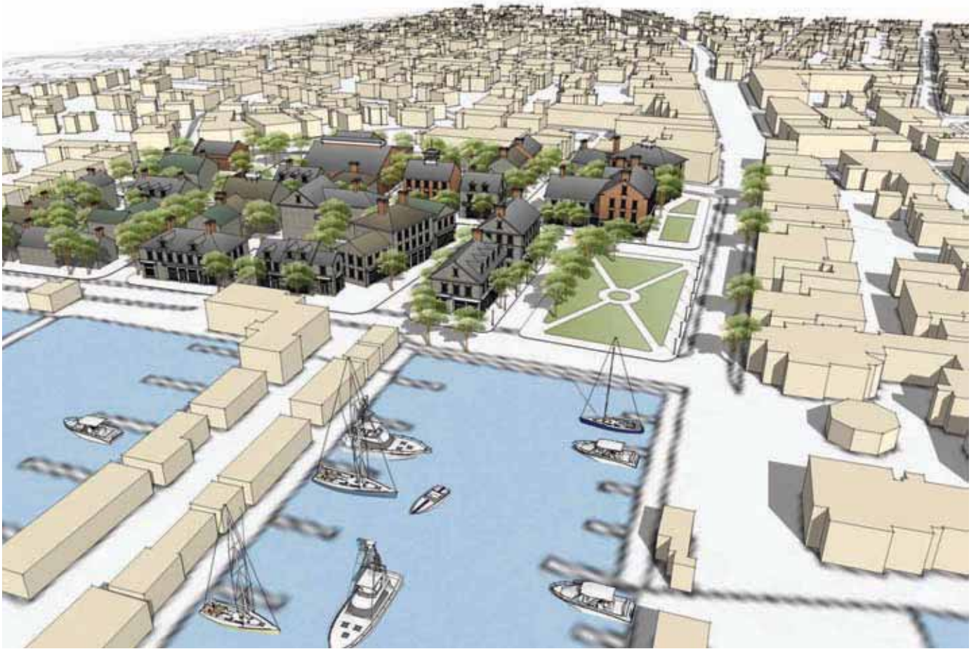
A bird's-eye perspective of the proposed new waterfront neighborhood for Nantucket.