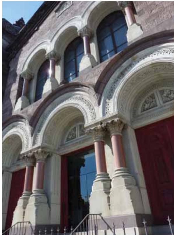
Congregation Rodef Shalom is one of several institutions in the Redevelopment Neighborhood Zone (left).