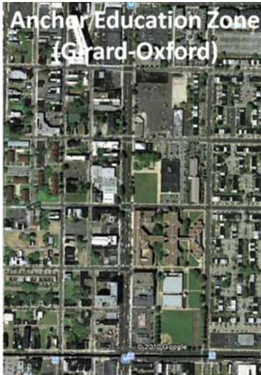
An aerial view of the Education Anchor Zone.

Vacant land is a problem in sections along the corridor.