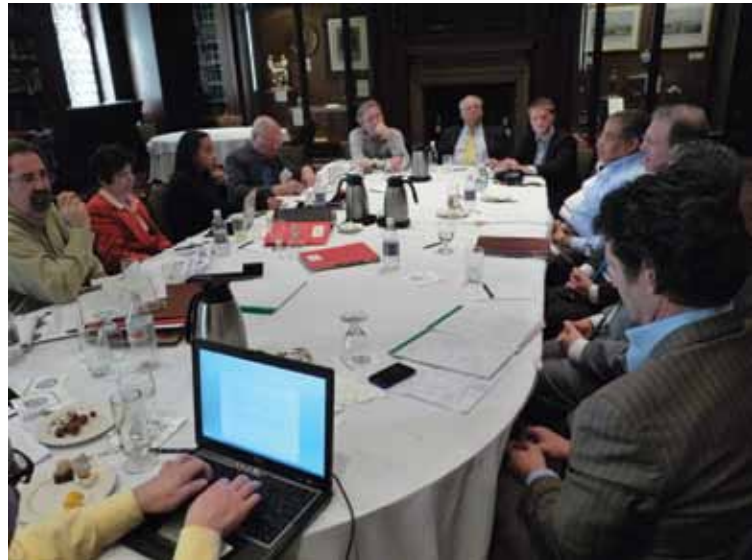
The Advisory Services panel interviewed numerous stakeholders with an interest in the North Broad corridor.