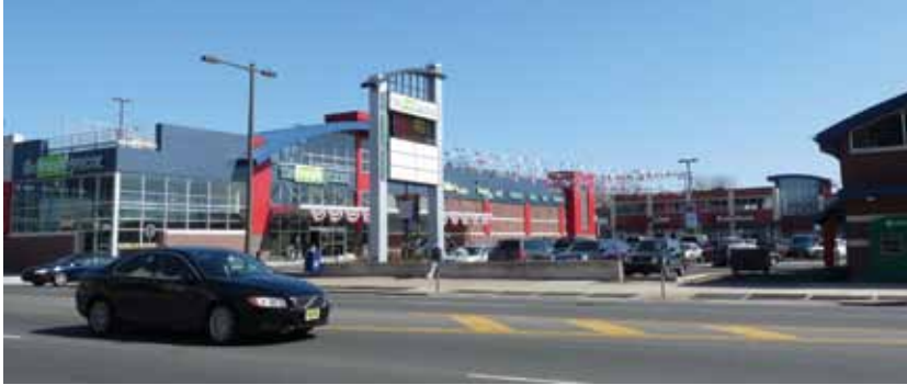
The redevelopment of Progress Plaza brought a new supermarket to North Broad (left). New commercial development about the Temple University campus (right).