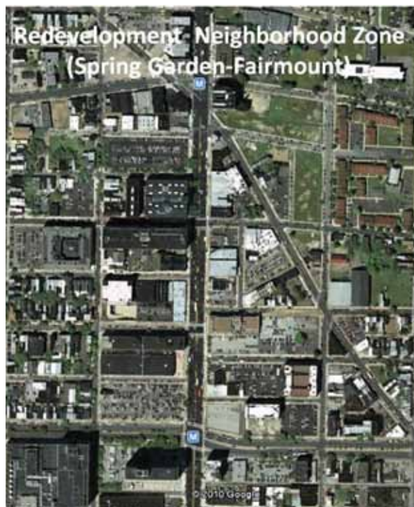
An aerial view of the Redevelopment Neighborhood Zone.

Vacant land in this zone needs to be maintained and kept clean to convey the right message to the neigh-