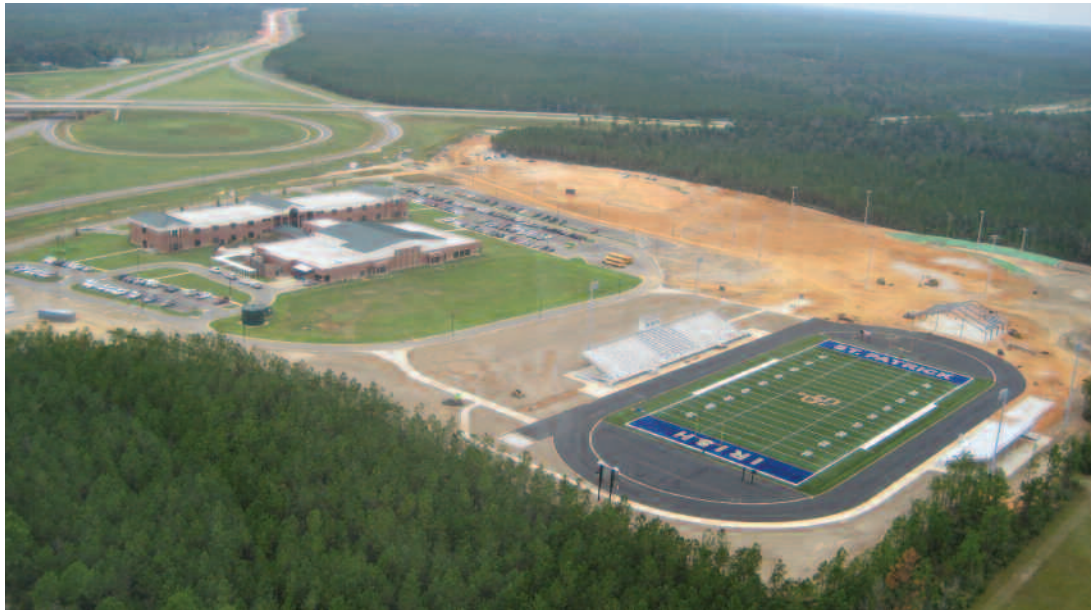
St. Patrick Catholic High School opened at Tradition in 2007.

Hurricane Katrina. William Carey plans to grow to serve 3,000 students within ten years. St. Patrick Catholic High School opened a new campus for 600 students at Tradition in fall 2007.