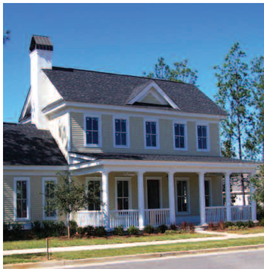
The Village at Tradition features traditional architecture and a variety of housing sizes.

Columbus Communities invited a ULI Sustainable Development Panel to help define and recommend appropriate sustainable development practices for Tradition. Columbus Communities requested the panel's assistance in making Tradition a national model for large-scale, greenfield, sustainable community development. As part of the assignment, the sponsor asked the panel to establish a definition for sustainable development for Tradition and translate that definition into a vision that would