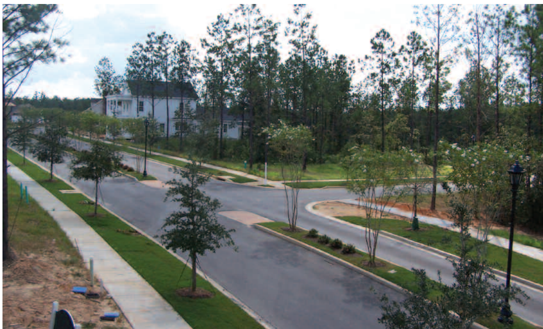
The Village at Tradition follows the principles of traditional neighborhood design, including people-friendly and landscaped streets.