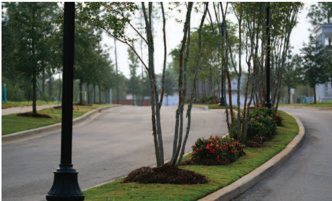
Landscaped medians bring nature into the heart of Tradition.

Sustainable communities connect the ecosystem of their site to the ecosystem of their watershed. A watershed is a unit of land with a common low point. Ecological connections ensure that the various energy flows inherent in the site's natural ecosystem are maintained or improved during the