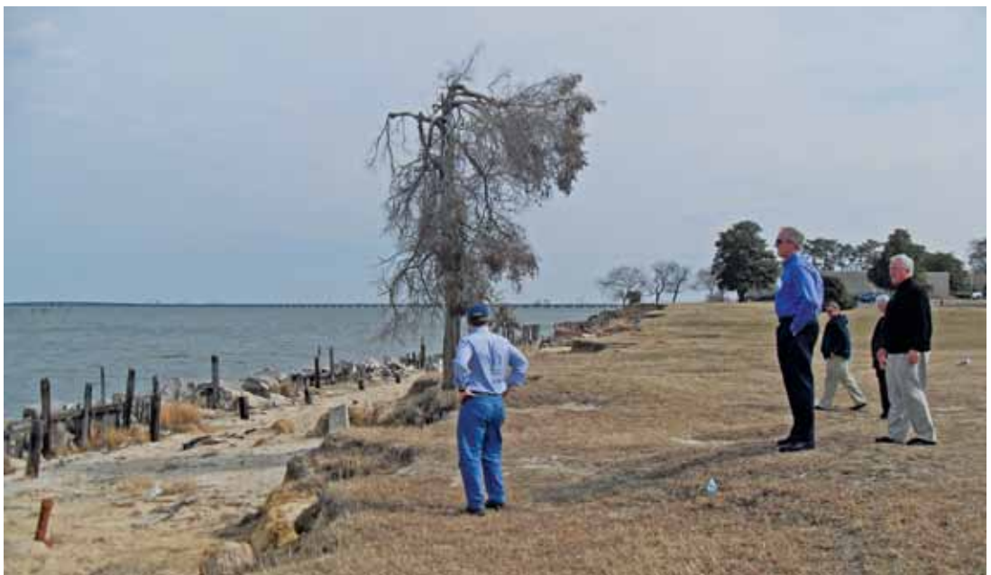
The ULI panel touring the waterfront on the Tidewater Community College Real Estate Foundation site.

Much about the future, particularly when measured over the next 20 to 30 years, is speculative at best. However, from looking back at the last ten to 20 years and a review of projections, the panel quickly came to the conclusion that population and employment growth are likely certain to continue in the Hampton Roads Metropolitan Statistical Area (MSA). The area's physical and strategic proximity to the key sustainable