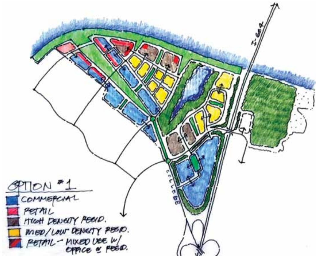
Option One: Commercial uses define the community spine.

Uses could include R&D, corporate offices, office suites, medical offices, and support services such as food and beverage establishments. A signature open