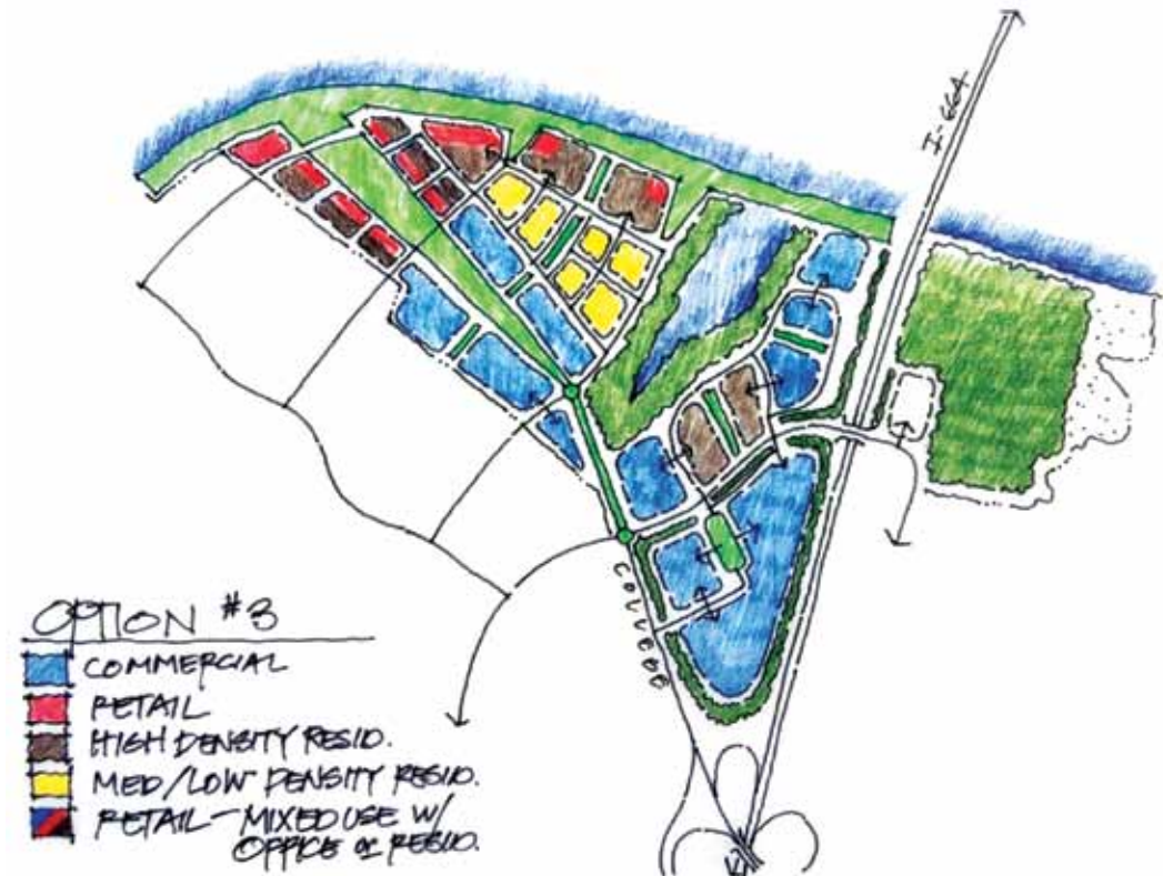
Option Three: Residential and commercial uses define the community spine.

The panel believes that the waterfront gathering place needs to establish a theme that embraces the unique history of the site. A large plaza with iconographic elements that include a water feature, stepped seating, and multiple places for small and large groups to gather is important. A proposal for a wind-energy testing turbine that is related to workforce education and training is also a possibility for inclusion in this area.