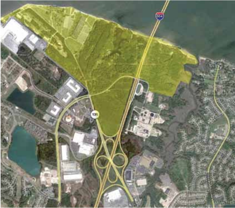
A current aerial photo illustrating the site's proximity to Hampton Roads and excellent access from I-664.

At the request of the city and the TCCREF, the Urban Land Institute was asked to provide recommendations on the economic development and redevelopment opportunities for the site. The scope of the panel's work centered on the following areas of inquiry: