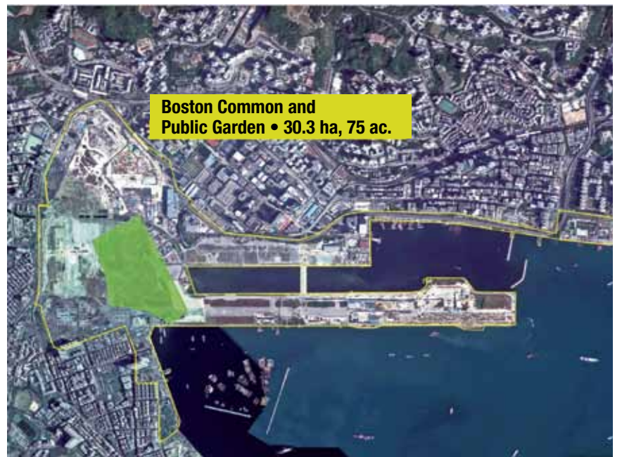
An overlay of Boston Common (in green) in Boston, Massachusetts, on Kai Tak.