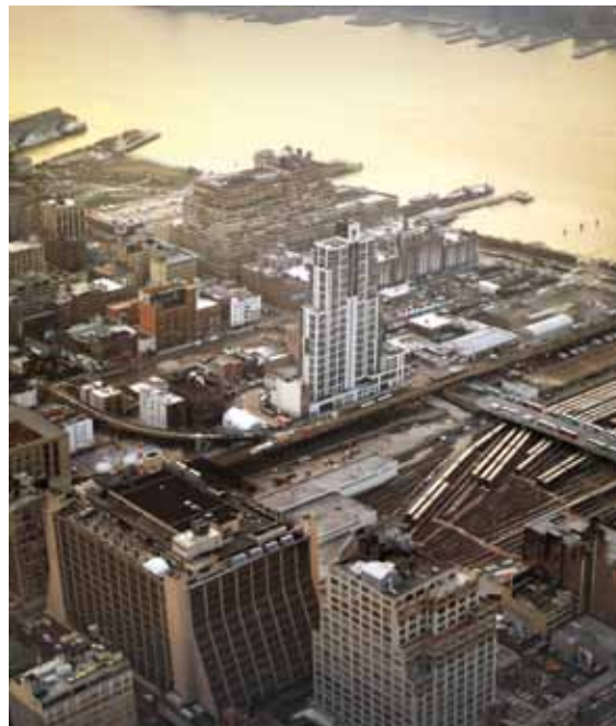
Hudson Yards in New York City.