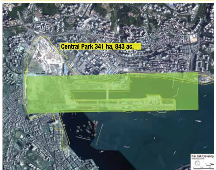
An overlay of Central Park (in green) in New York City on Kai Tak.

Boston Common is a 20-hectare (50-acre) park located in downtown Boston, Massachusetts. Steeped in colonial and early American history, the Common evolved from a utilitarian common ground for activities such as grazing, militia formations, and public hangings to the locus for many events before and after the American Revolution. Located adjacent to the Massachusetts State House, the Common has acted as public assembly space for many momentous events from Civil War abolitionist gatherings and end-of-war celebrations after World War II to Vietnam War protests. Its primary function is as a passive open-space park, and it is a significantly more intimate space than Central Park.