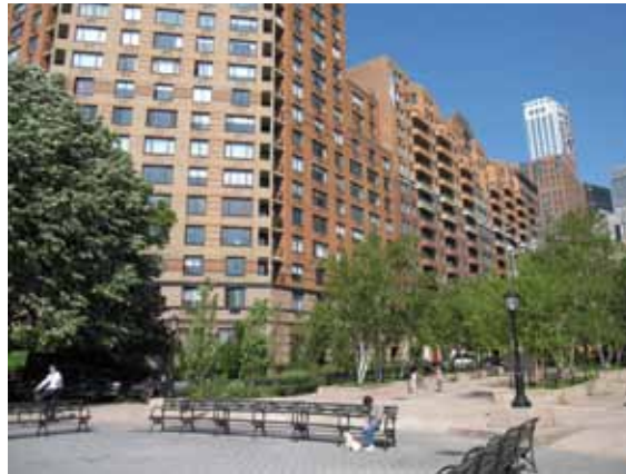
Battery City Park in New York City (left and below).

Numerous other examples exist of development corporations that manage large, long-term development projects: Milton Keynes in Buckinghamshire, the Olympic Park Legacy Company for the London 2012 Games, the Cincinnati Center City Development Corporation, the Sentosa Development Corporation in Singapore, and Dubai Land. For Kowloon East, a new and entirely unique model of a development entity must be created that can meet the financial and economic goals of Hong Kong SAR while encouraging the new vision for the area.