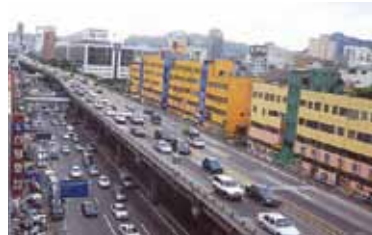
The Kai Tak River presents an incredible opportunity to create an exciting amenity such as that on the Cheonggyecheon River in Seoul, South Korea, shown above. At left is the area in Seoul before development of the park.