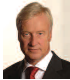
First Mayor Ole von Beust President of the Senate of the Free and Hanseatic City of Hamburg, Germany